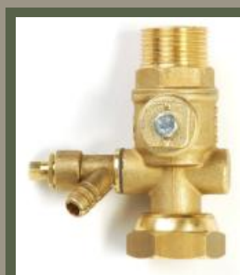
combined lock shield valve and drain cock

Intaeco Limited Airfield Industrial Estate, Hixon, Stafford ST18 0PF