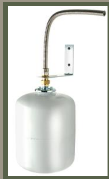
expansion vessel connection kit SOVK-A200