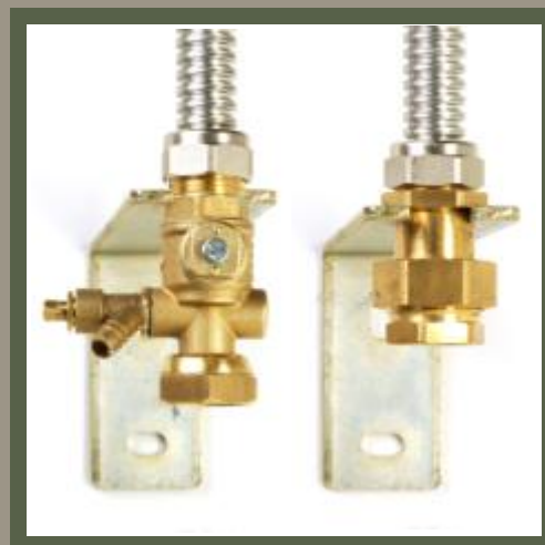
expansion vessel isolation valve detail