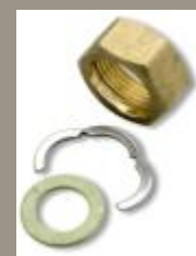
female thread with c clip & gasket

Now place a "C" clip behind the flange. This ensures that the brass union nut does not damage the flange on tightening.