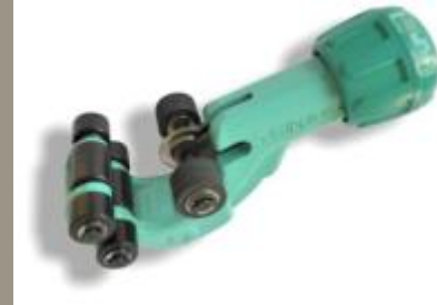
Inta Inox pipe cutter

Place the nut on the pipe and then clamp the bar leaving 3 ridges of pipe above the jaws.