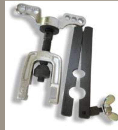
Inta Inox flanging tool

Compress the pipe by winding down the handwheel. Use the ratchet action to tighten until flat. The flange is now formed.